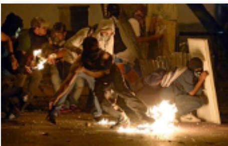
Guarimbas throwing petrol bombs — 'Molotov cocktails'

And the level of police restraint is remarkable — the government knows the world is watching. One evening protesters were burning buildings for around two hours, with no intervention by the police. They only react when the protesters start throwing petrol bombs at the police or military, or their bases — but as soon as they do react, the guarimbas film as if they're victims of an unprovoked attack.