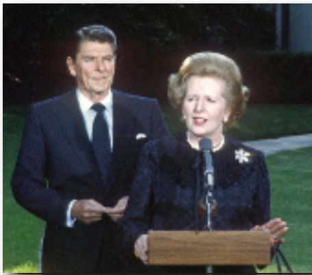
'No alternative'... Ronald Reagan and Margaret Thatcher at the White House.

Financial meltdown, environmental disaster and even the rise of Donald Trump – neoliberalism has played its part in them all. Why has the left failed to come up with an alternative?