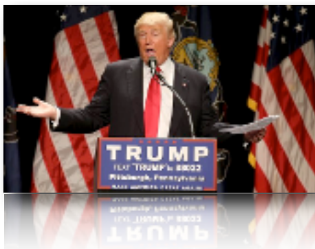
Slogans, symbols and sensation ... Donald Trump.

Perhaps the most dangerous impact of neoliberalism is not the economic crises it has caused, but the political crisis. As the domain of the state is reduced, our ability to change the course of our lives through voting also contracts. Instead, neoliberal theory asserts, people can exercise choice through spending. But some have more to spend than others: in the great consumer or shareholder democracy, votes are not equally distributed. The result is a disempowerment of the poor and middle. As parties of the right and former left adopt similar neoliberal policies, disempowerment turns to disenfranchisement. Large numbers of people have been shed from politics.