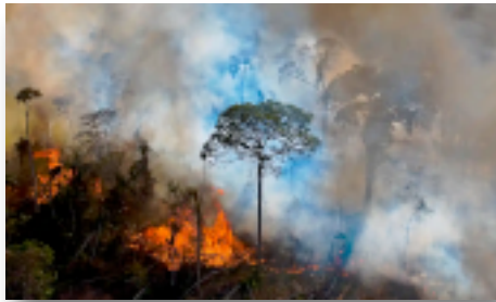
Smoke rises from an illegally lit fire in the Amazon rainforest reserve, south of Novo Progresso in Pará State, Brazil.

Much of the Amazon could be on the verge of losing its distinct nature and switching from a closed canopy rainforest to an open savannah with far fewer trees as a result of the climate crisis, researchers have warned.